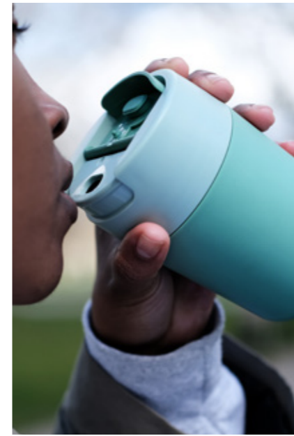
Flip-top cap completely covers mouthpiece for better hygiene