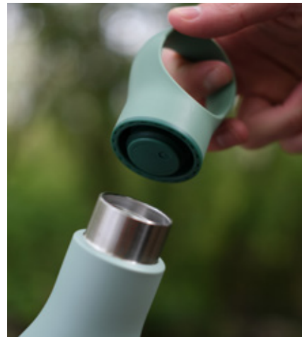
Leakproof and won't cause condensation in your bag