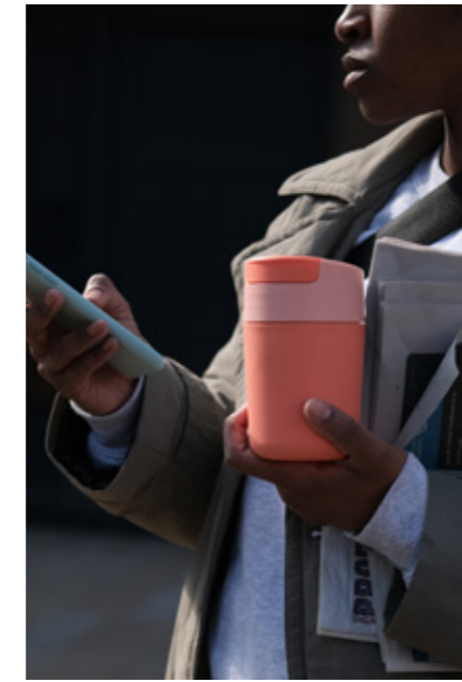
Comfortable, non-slip grip