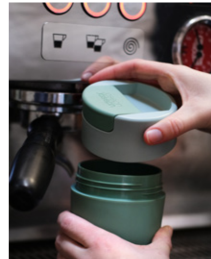
Leakproof, screw-top lid