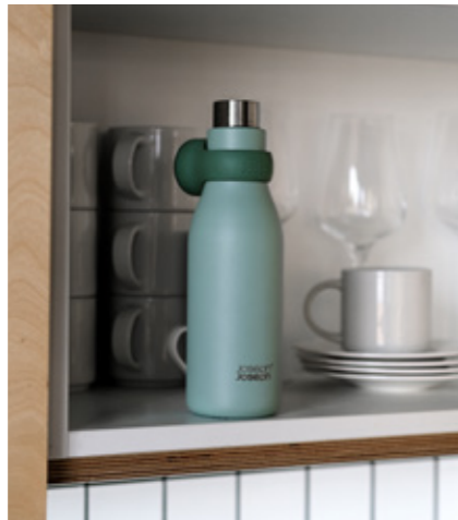
Lid stores neatly on neck of bottle