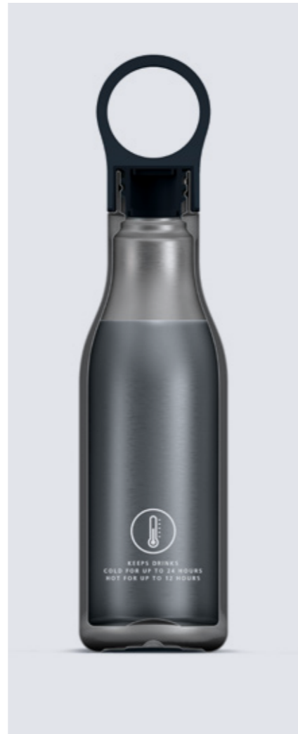
Vacuum insulation keeps drinks hot for up to 12 hours and cold for up to 24 hours

Dimensions H29 x W7 x D7 cm (H11.4 x W2.7 x D2.7 inches)