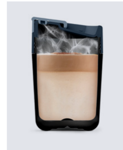
Double-walled, vacuum insulated stainless steel remains cool to the touch (Sipp™ Steel only)